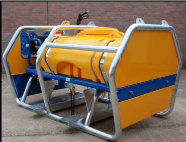
Rear Alloy Infill Plates

Specification may differ per country. Brendon reserves the right to alter the specification without notice.