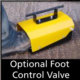
Optional Foot Control Valve

Community Design No: 000235429 UK Registered Design No: 2098802