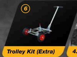
Trolley Kit (Extra)