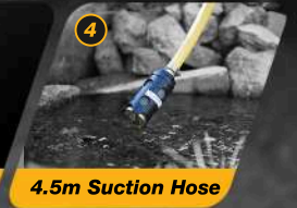
4.5m Suction Hose