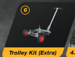
Trolley Kit (Extra)