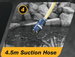
4.5m Suction Hose