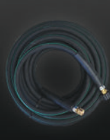
HOSE ONLY 10M - 75M